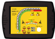
KOPS Over Moment Limitor