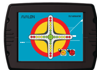
KOPS Tilt Indicator